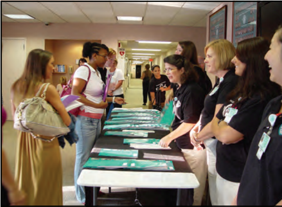
Student Ambassadors welcome incoming students

It's an exciting time in the Admission Office! On August 15, CCHS welcomed 173 new students. The incoming class consists of these students: 19 Radiology, 9 Radiation Therapy, 8 Medical Laboratory Science, 72 Nursing, 43 Pre-Nursing, and 22 General Studies students. Thank you for choosing Carolinas College of Health Sciences for your healthcare education. If you see new faces around the campus, please give them a "CCHS warm welcome"!