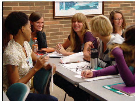
New students participate in ice-breakers presented by Student Ambassadors and Student Government Association officers